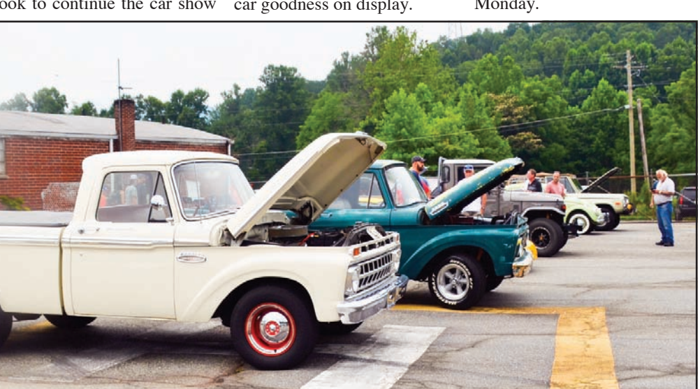
Blue Ridge Mountain EMC's old headquarters served as the base of operations for the Memory Lane Car Show over the weekend.

Charitable proceeds for the weekend festivities were not available by press time Monday.