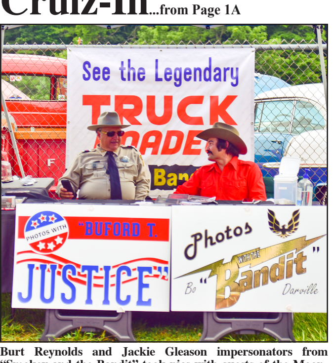
"Smokey and the Bandit" took pics with guests of the Moonshine Cruiz-In. Replicas of the Bandit's Pontiac Trans-Am and Sheriff Buford T. Justice's Pontiac LeMans were also nearby.