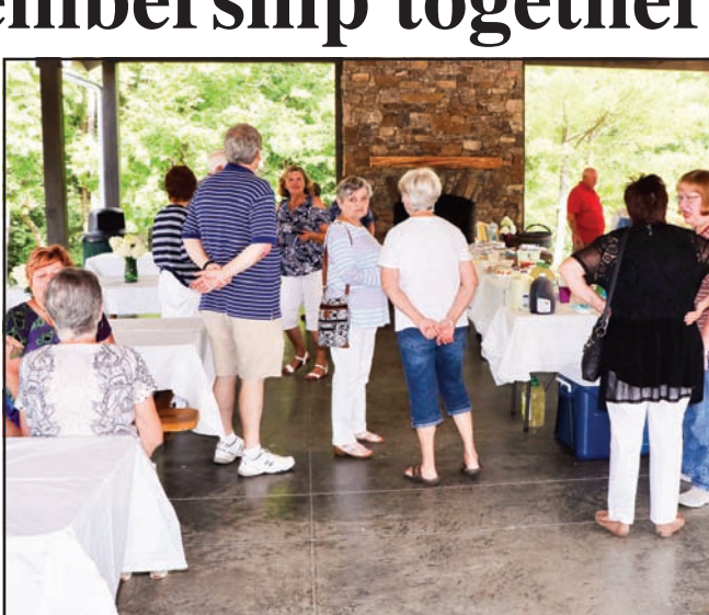
Union County Historical Society members were glad to be meeting for their annual picnic in 2021 inside the beautiful new pavilion at Meeks Park.