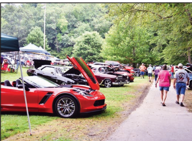
The Georgia Mountain Moonshine Cruiz-In's first year at Meeks Park was a resounding success, registering 768 cars from 21 different states.

"We should see upwards of 700 cars (registered) by See Cruiz-In, Page 6A