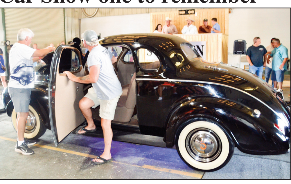
The Memory Lane Classic Car Auction & Show gave people the opportunity to simultaneously see classic cars and bid to take one home.